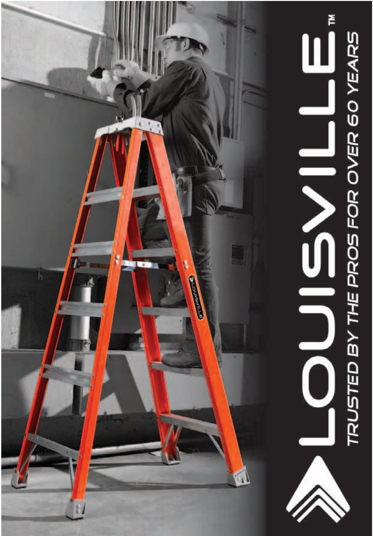
Inspired by a local city poster campaign, I created this as a “generic” advertisement for the Louisville Ladder brand. This ad was so well-received, it was decided that this color on grayscale with vertical logo theme would be the driving force behind our future promotional marketing pieces.